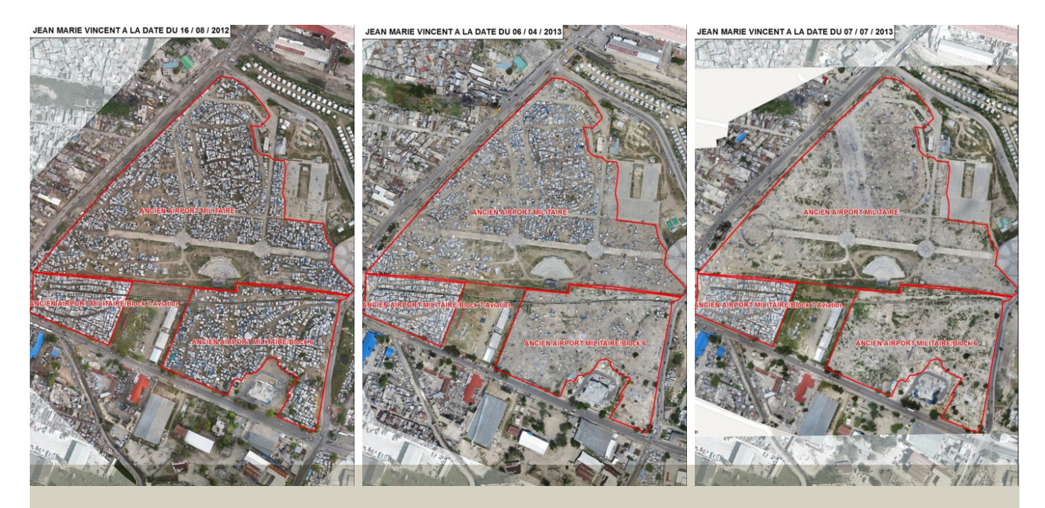
Figure 2 The evolution of Jean Marie Vincent Camp in Port-au-Prince was monitored by IOM until its closure in 2013