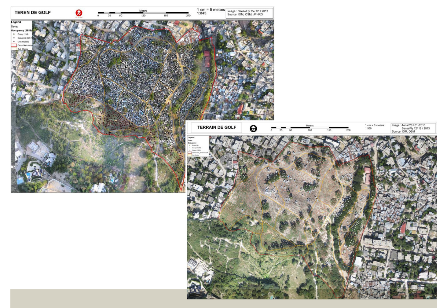
Figure 3 Evolution of Teren de Golf camp between March (see top left) and December 2013 (bottom right)