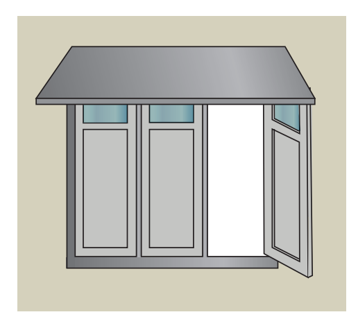
Partially glazed casement window.

Casement windows open to expose 90% of the window area, and provide better natural venti-